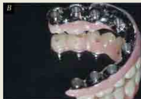
FIGURE 3B Anterior ridge-lap for phonetic seal and posterior sleuth ways for oral hygiene access.