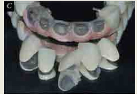
FIGURE 2C Bisque bake. Individual porcelain-fused-to-gold crowns.