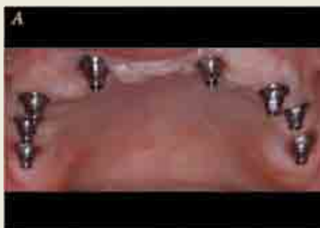
FIGURE 3A Eight dental implants: external hex Osseotite regular diameter. Conical transmucosal abutments, intraoral view, which will secure a fixed-detachable crossarch stabilized maxillary acrylic-fused-to-gold prosthesis with an anterior modified ridge-lap design.

To provide a phonetic seal, it is advantageous to minimize air-escape under the prosthesis. However, the ability to access the intaglio region for oral hygiene is the overriding factor dictating the intaglio design of the prosthesis. Consequently, aggressive ridge-lap features (buccal-lin-