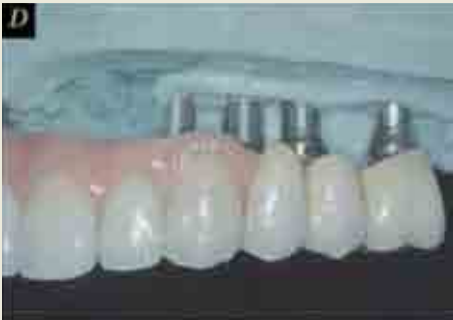
FIGURE 2D AND FIGURE 2E Anterior modified ridge-lap design.