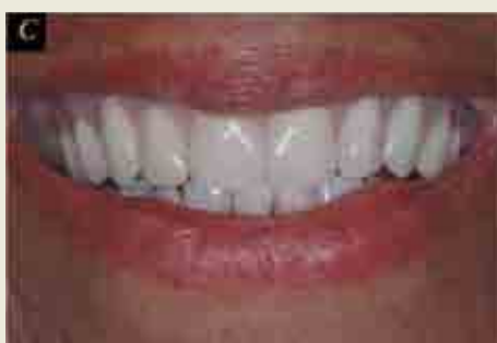
FIGURE 3C Delivered prosthetic.