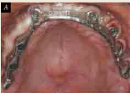
FIGURE 4A Crossarch stabilized 2° milled UCLA direct-to-implant platform primary bar attached to eight dental implants: NobelReplace™ Select (Nobel Biocare), six regular diameter and two wide diameter implants, which will secure a maxillary retrievable lingual-set screw-retained porcelain-fused-to-gold restoration.