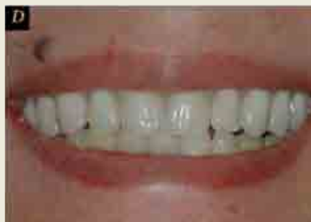
FIGURE 1D AND FIGURE 1E Completed prosthesis in place (surgery by Dr. Ole T. Jensen, oral and maxillofacial surgeon, Greenwood Village, CO).

When six to eight conventional root-form titanium dental implants are placed, they can be distributed broadly from anterior to posterior, minimizing the need for cantilevers. Biomechanically, cantilevers tend to increase the loads on terminal implants by three times. 30 To allow for a wide anteroposterior distribution of implants, grafting of the posterior pneumatized sinus regions is required. Longitudinal retrospective studies have shown the implant survival rate in atrophic maxillae augmented with sinus grafts, using a variety of materials and techniques to be high: 80% to 90% success rate at integrating dental implants of at