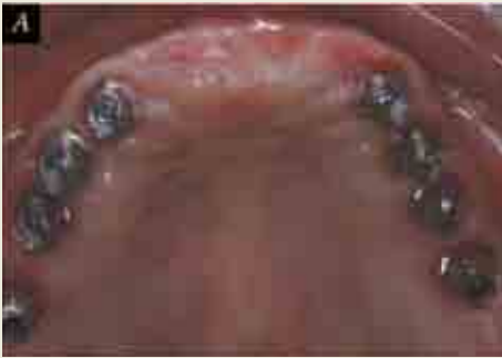
FIGURE 2A Eight dental implants: external hex Osseotite regular diameter (Biomet 3i, Palm Beach Gardens, FL). Implants positioned from canine to first molar regions. Custom gold UCLA abutments with lingual set-screw tap, which will secure a fixed-detachable, crossarch stabilized maxillary porcelain-fused-to-gold prosthesis, anterior-modified ridge-lap design.