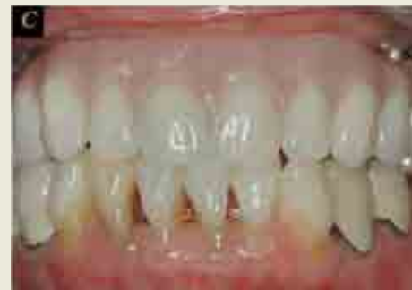
FIGURE 1C Intraoral view. The group function occlusal scheme maximizes stress distribution and minimizes the potential for teeth/acrylic veneer fractures.

literature as a viable treatment option for the completely edentulous maxilla, minimizing the need for significant additional sinus grafting. 21-25 The zygomatic implant, intended for anchorage in the zygoma, was designed with a 45° prosthetic platform. This implant is indicated for patients with moderate to severely resorbed maxillae and has been documented to be successful in supporting fixed maxillary prostheses. 11,12,26,27 These posterior zygomatic implants are used in conjunction with two to four anterior conventional root-form dental implants with splinted crossarch support. With this concept, treatment can be in the form of a conventional delayed/two-stage approach or immediate function when patient criteria selection allow. 11,28 The prosthesis is often in the form of a fixed detachable, crossarch splinted, acrylic-fused-to-metal design. The disadvantage with this approach is that it is implant-system specific and technique-sensitive. The final position of the zygomatic implant platform is often palatal to the residual ridge crest, complicating the design and fabrication of the prosthesis. Recent advances in the surgical technique, such as the sinus slot technique, have helped to improve final implant positioning closer to the first molar central ridge crest. 13,29