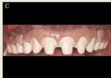
FIGURE 4C Intraoral bisque bake primary and superstructure try-in.