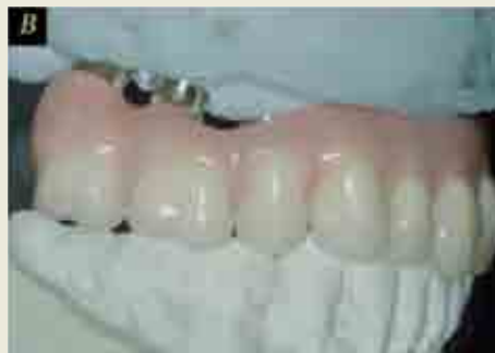
FIGURE 1B The modified anterior ridge lap provides a phonetic seal and posterior sleuth ways for oral hygiene access are positioned above the smile line.