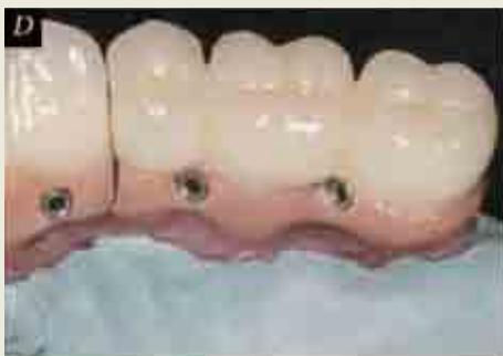
FIGURE 4D Finished prosthesis: master cast, lingual view; lingual-set prosthetic screw retention to primary bar: 8 screws (Bredent GmbH & Co KG).