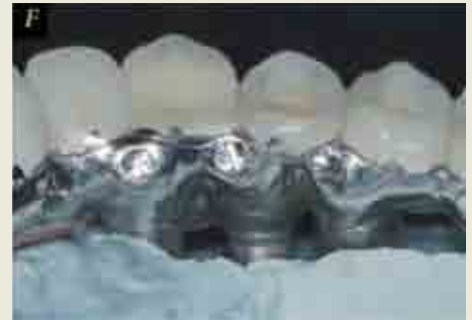
FIGURE 2F Lingual-set screw retention.