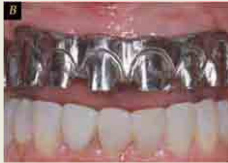
FIGURE 2B Framework try-in. Note the individual crown preparations incorporated in the metal framework design. Framework attached to the individual custom abutments via prosthetic lingual-set screws (Bredent GmbH & Co KG, Senden, Germany).