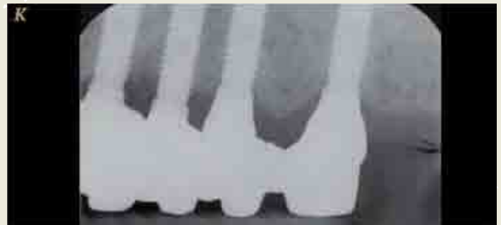
FIGURE 2J AND FIGURE 2K Radiographs, 42 months after prosthetic delivery.