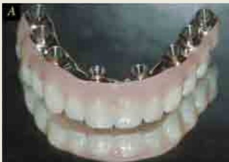
FIGURE 1A A fixed-detachable, crossarch stabilized maxillary acrylic-fused-to-gold prosthesis with an anterior-modified ridge-lap design. The prosthesis will be anchored with eight external hex regular diameter implants with conical transmucosal abutments.