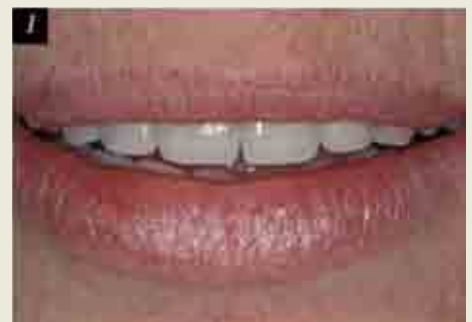
FIGURE 2G THROUGH FIGURE 2I Delivered prosthesis (surgery by Dr. Ole T. Jensen, oral and maxillofacial surgeon, Greenwood Village, CO). The group function occlusal scheme maximizes stress distribution.