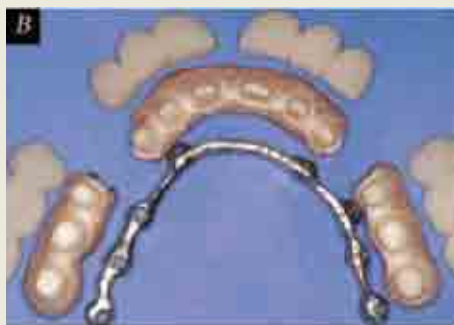
FIGURE 4B Prosthetic Sections: 2° milled primary bar providing crossarch stabilization; three-piece superstructure, porcelain-fused-to-gold, individual tooth preparation design, pink porcelain, opaque retainer crown preparations; four-piece splinted pressed all-ceramic crowns, bisque bake.