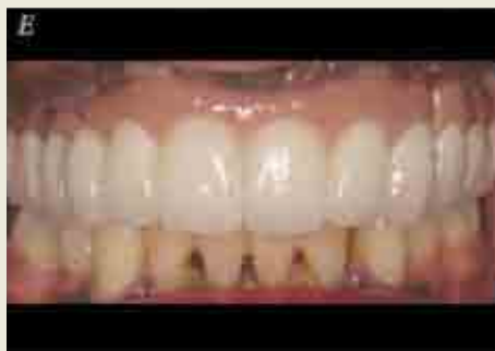
FIGURE 4E AND FIGURE 4F Definitive prosthesis: intraoral view and smile (surgery by Dr. Allan Pomeranz, periodontist, Denver, CO). The group function occlusal scheme maximizes stress distribution.